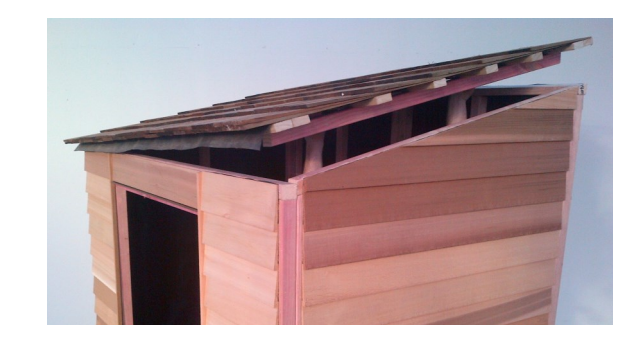
Step 13: Position roof panel on shed as shown.

Step 14: Using 75mm tek screws, screw roof panel into end wall panels, (2 screws each end).