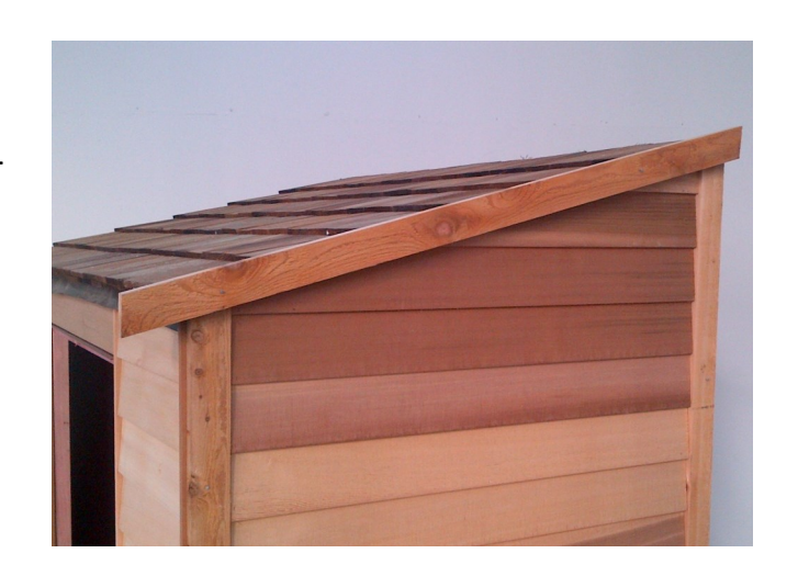
Step 17: Nail barge boards to ends of purlins, using 50mm bead nails. (1 nail per purlin)

Step 18: Ensure shed is square, by measuring internal diagonals at bottom corner of wall panels.